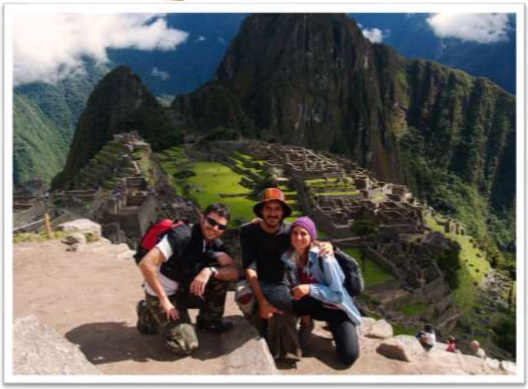
Peru 5 Days Lima, Cusco, Machu Picchu, Cusco, Lima