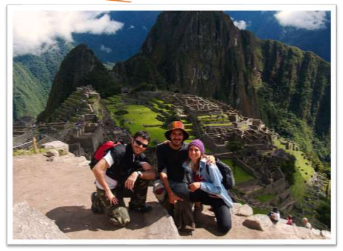
Peru 15 Days

Lima, Paracas, Islas Ballestas, Nazca, Arequipa, Colca Canyon, Puno, Titicaca Lake, Cusco, Machu Picchu, Sacred Valley, Cusco, Lima.