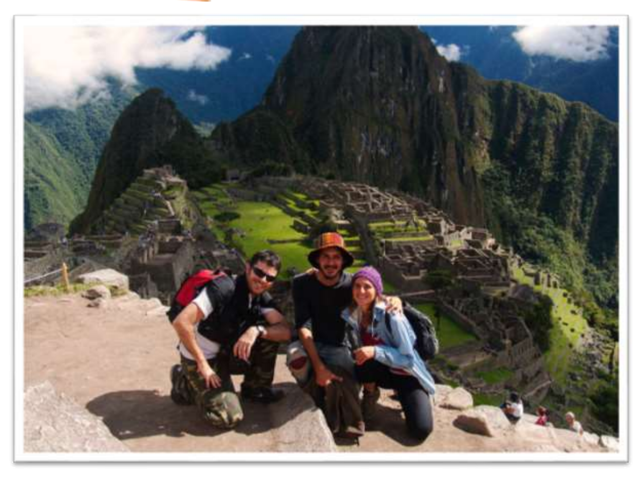
Fascinating Peru 12 Days Lima, Cusco, Machu Picchu, Sacred Valley, Puno, Titicaca Lake, Juliaca, Lima, Nazca, Paracas, Lima